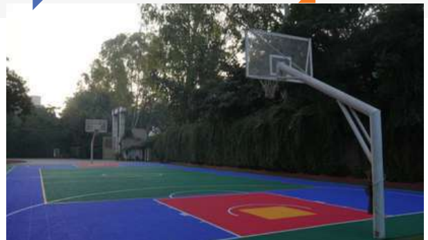
Basketball court paved with premium tiles.