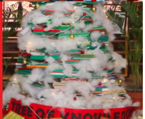
Tree craft: our tree of knowledge has books at the centre

TO MARK THE CLOSE OF THE TERM AND THE YEAR, HAPPY HOURS SCHOOL SPREAD SMILES AND WARMTH AT THE WINTER CARNIVAL.