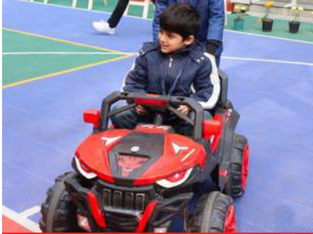
A fun-filled extravaganza with games, a buggy ride