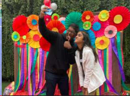
'WOW' moments for our beloved children