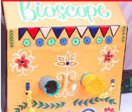
Learning and fun go together

TO MARK THE CLOSE OF THE TERM AND THE YEAR, HAPPY HOURS SCHOOL SPREAD SMILES AND WARMTH AT THE WINTER CARNIVAL.