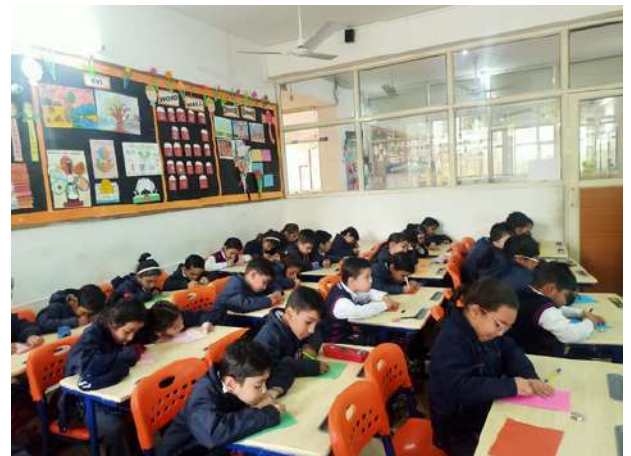
Our classrooms are refurbished with new furniture.