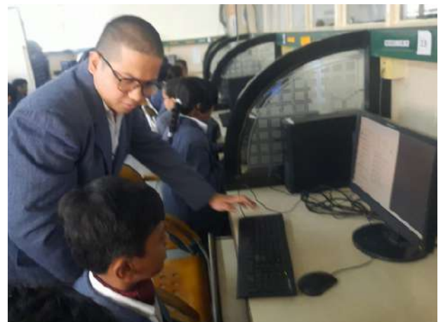
Peer-to-peer education from older students in our computer lab.